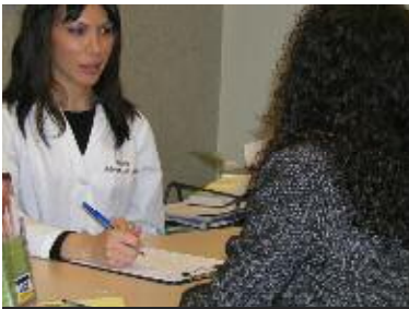
My Initial Consultation