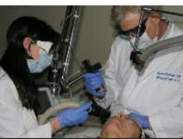
Skin tightening around the eyes